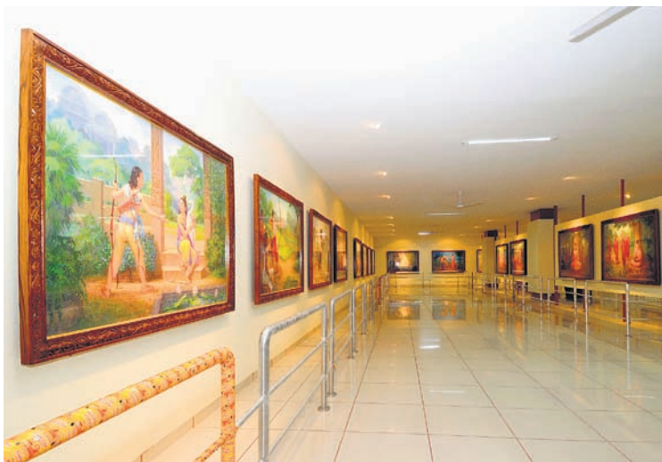
The art gallery at the pagoda.

Further, taking into consideration the augmenting number of tourists, the Mira Bhayandar Municipal Transport (MBMT) has started running buses from Bhayandar to Gorai.