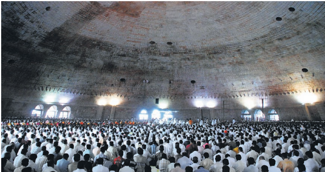
A meditation session in progress.

The Global Vipassana Pagoda in Gorai is attracting large numbers of visitors