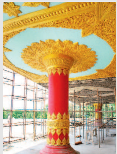
The intricate work seen at the entrance